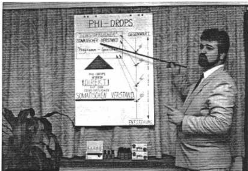
Oefeli explains the purely intricate method of working of the PHI-LAMBDA-products.

The following example may serve to clarify