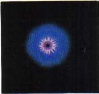
Belladonna - Urtinktur