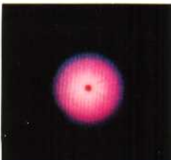
Belladonna - D30

the organism. In this sense the invalid is not really healthy, because he remains open to another attack. In the best case, the stricken germ is conquered, perhaps also only stopped from reproducing, with the result that the patient can regain his strength after the attack.