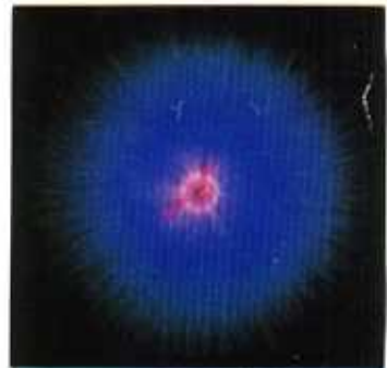
Arnica - D30