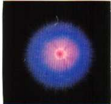
Arnica - D6