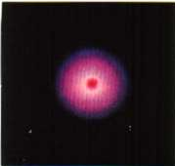
Belladonna - D1