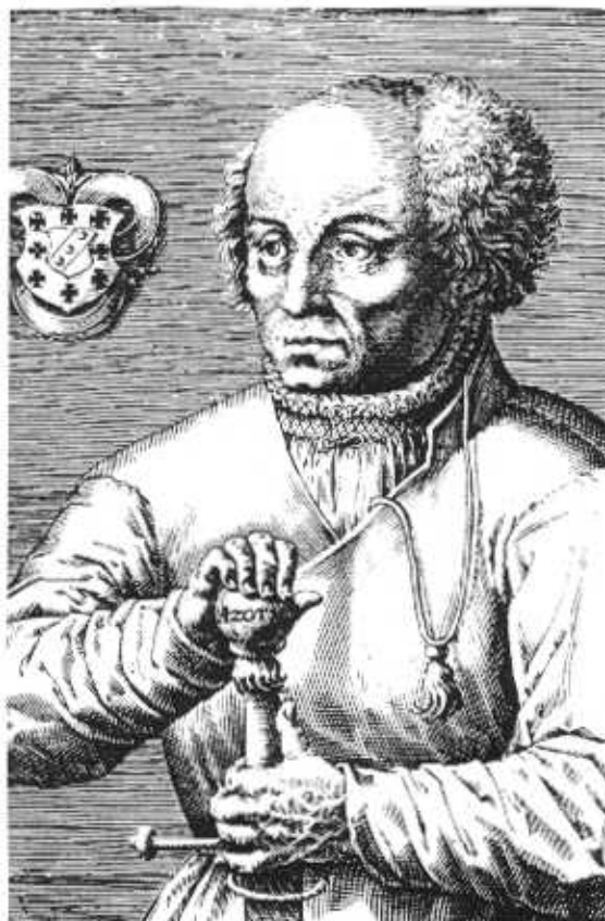
Aureolus Philippus Theophrastus Bombastus von Hohenheim (PARACELUS) Doctor and philosopher

what happens during this strengthening and why it has a positive effect on the organism of a sick person: