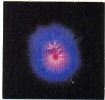
Arnica - D1