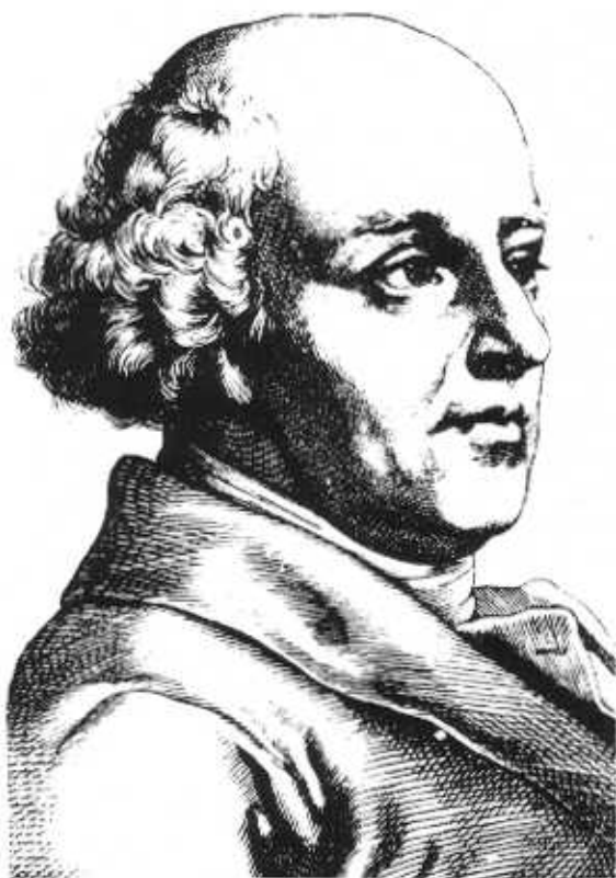
christian Friedrich Samuel Hahnemann Founder of Homoeopathy

The second principle of homoeopathy , that of "increasing potency", was the necessary product, so to speak, of the first principle.